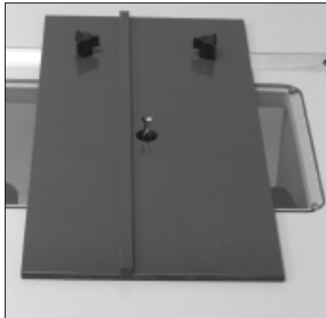
Shown attached to Track Filler Strip